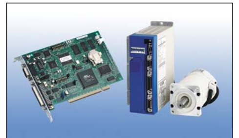
Dynaservo servomotors eliminated the need for a costly zero-backlash gearbox in Karsh's machine.

The use of Dynaservo servomotors for material feeding and positioning operations eliminated the need for a costly zero-backlash gearbox, and resulted in increased process accuracy of 0.001 to 0.002 of an inch. The introduction of the PC system equipped with Dynaservo PCI-bus type motion controller and advanced software was said to significantly improve process control and monitoring, and at the same time simplify machine operation. The operator graphically selects the type of core lamination to be produced, dimensions, specifies locations of process actions (punch, notch, cut), and the quantity of laminations to be produced. The operator can also select a standard core lamination design from a library of available design configurations, wherein all required information is recalled from memory and displayed for the machine operator to confirm.